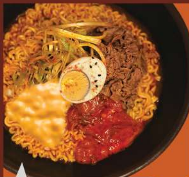
BEEF RAMEN BEEF + KIMCHI + CHEESE

Not sure what to choose? Try Pocha's recommended recipes!