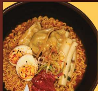
TTEOK MANDU RAMEN RICE CAKES + MANDU + KIMCHI